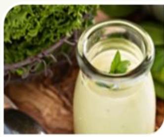
Dairy & Beverages