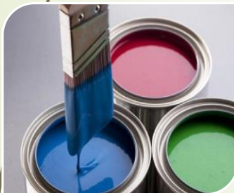
Paint & Coating