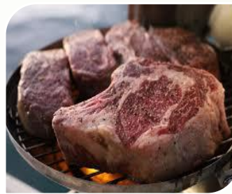
Meat & Culinary