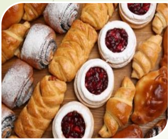
Bakery & Confectionery