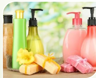
Personal Home Care